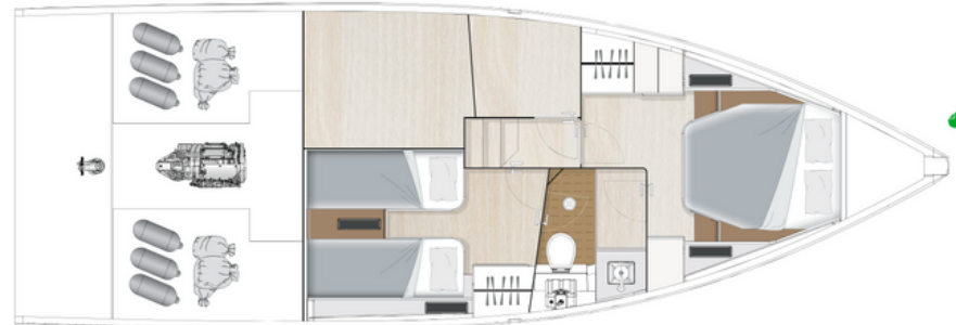
Lower deck Option 1. One master with two singles and single head