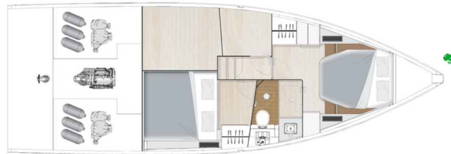
Lower deck Standard arrangement. Two double cabins single head