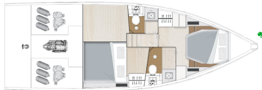
Lower deck Option 2. One master with one double and two heads